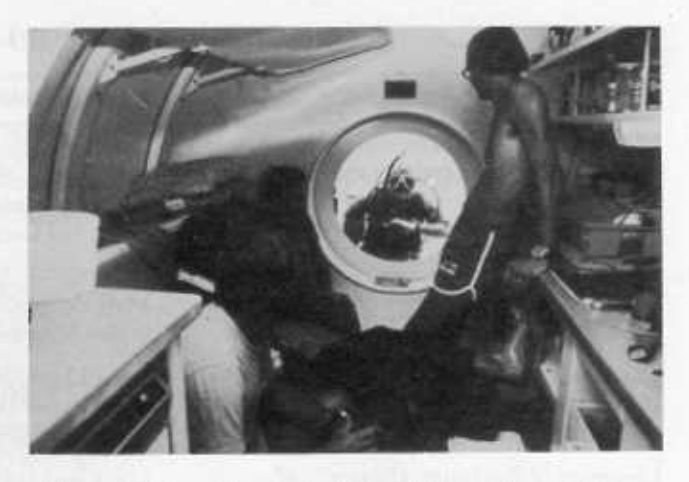
Figure II-2D .- Divers in habitat watching colleague enter.