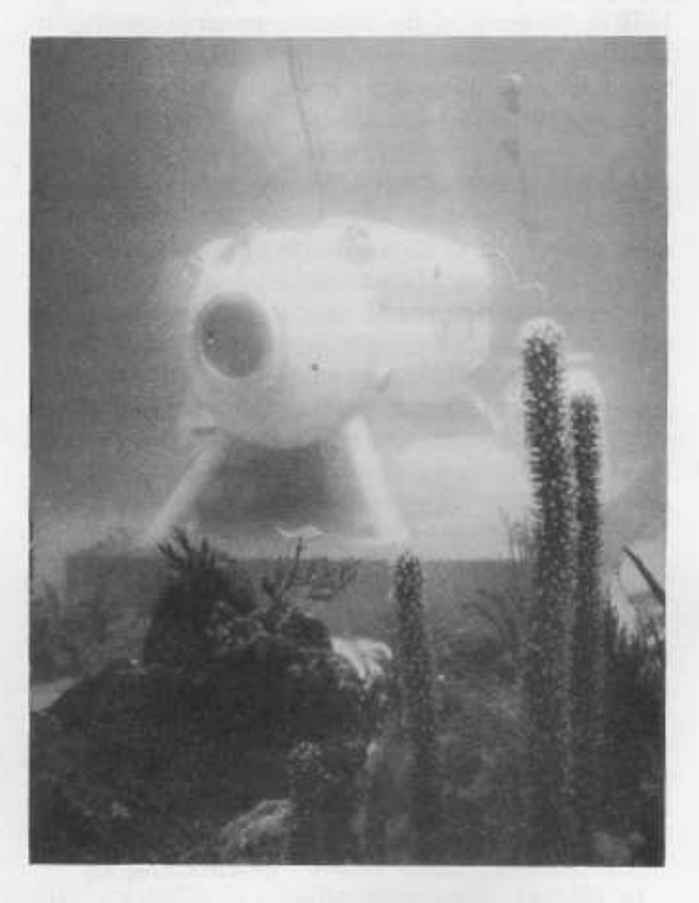
Figure II-2B.-Habitat HYDROLAB in place on the seafloor.

The HYDROLAB is submerged at a depth of 15.2 meters, but excursion dives can be made to depths of 40 meters using the habitat as a base. The HYDROLAB has a double-lock entrance compartment and a 24-inch (diameter) entrance hatch. (Fig. II-4 shows a diver entering the habitat's hatch.) The facility has six external viewports, running water, electricity, heat, and three bunks for aquanaut/scientists. A diver support barge, shown in Figure II-5, supplies utilities to the habitat.