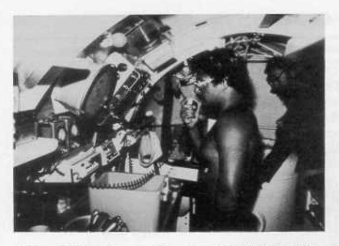
Figure II-2C.—Aquanaut/divers at work in HYDROLAB's laboratory.